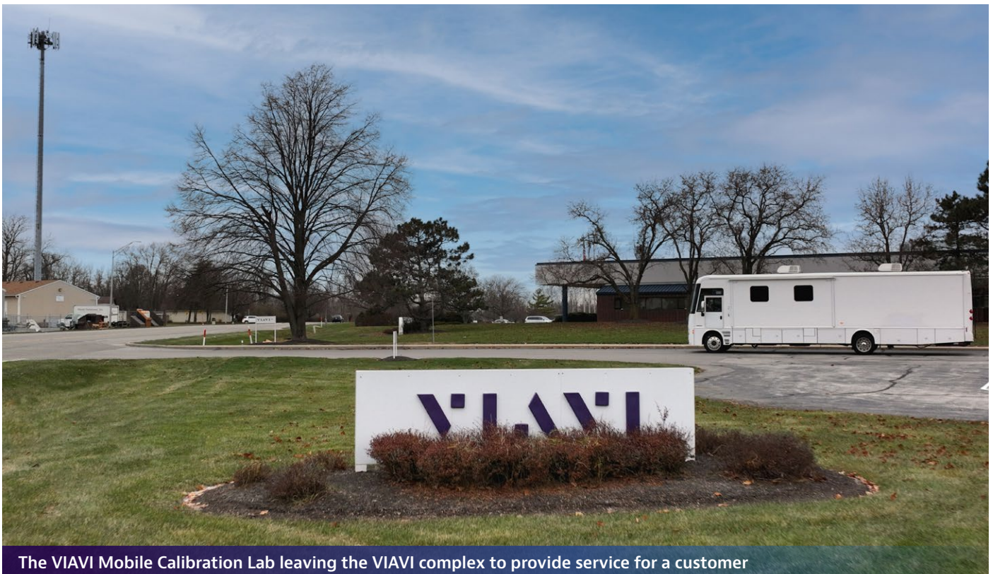
The VIAVI Mobile Calibration Lab leaving the VIAVI complex to provide service for a customer

Maintenance of your hardware that includes software and firmware updates, pigtail and connector maintenance and totally automated adjustments ensures your VIAVI products will work for years and keep your factory, lab, or service hub in compliance with audit requirements. Receive additional exclusive benefits when you purchase repair and calibration as part of a holistic Care Support Maintenance plan, including rapid 5-day turn-around time for return-to-VIAVI repair and calibration, added training and battery and bag replacement for 5-year plans.