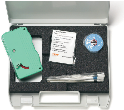
OCK-10 Optical Connector Cleaning Kit (accessory)