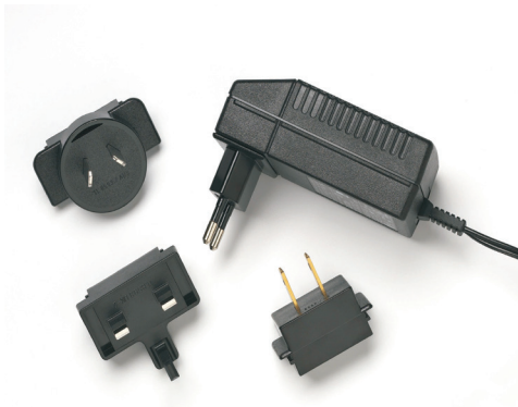
Worldwide compatible AC adapter/charger (SNT-121A)