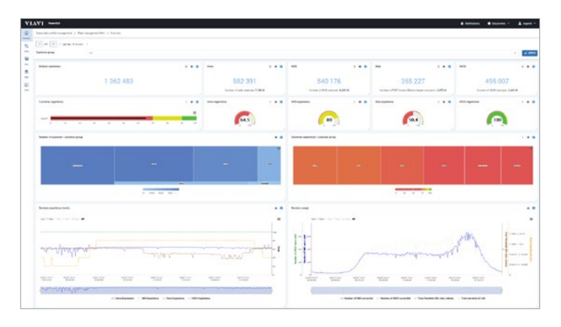
Fleet Management dashboard in VisionSLA

The end-goal is to ensure the best Quality-of-Experience possible.