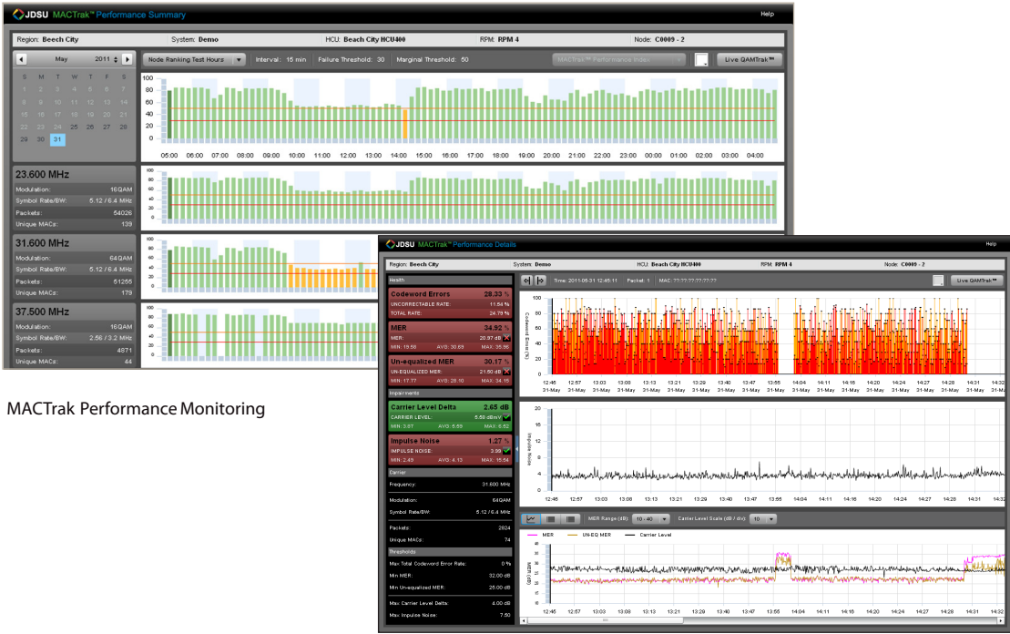
MACTrak Performance Monitoring

The V3.0 WebView software release addresses the needs of the NOC, maintenance planners, field technicians, and installers alike; therefore, making it a must-have for anyone committed to improving quality of service, operational efficiency, and network performance.