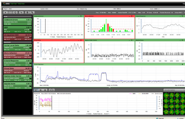
MACTrak Live Troubleshooting