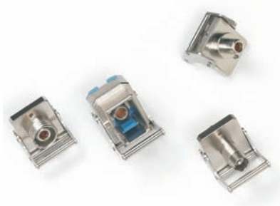
Optical adapters (BN 2150) for laser source output