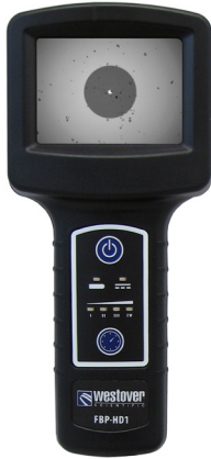
HD1 Handheld Display with 3.5-in LCD