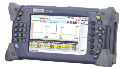
Two-Slot Handheld Modular Platform Fiber/Copper & Multiple Services Testing