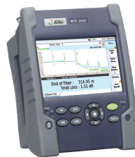
One-Slot Handheld Modular Platform Fiber Networks Testing