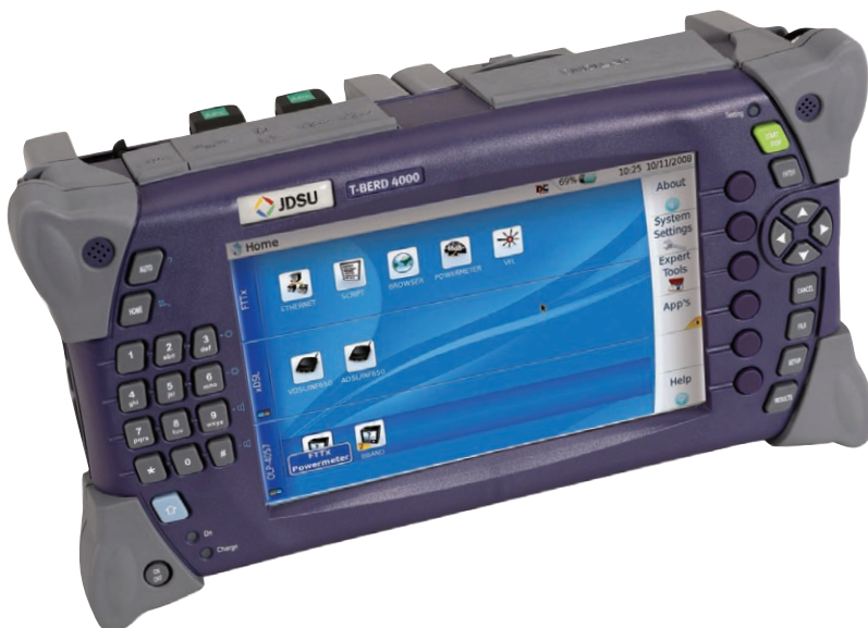
The JDSU T-BERD/MTS-4000 is the industry's first combined fiber, copper, and triple-play tester.