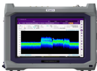
CellAdvisor 5G Cell site test solution