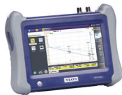
T-BERD/MTS-5800 Handheld test instrument for testing 10 G Ethernet and fiber networks