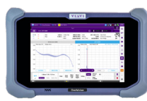
OneAdvisor-800 All-in-One Cell-site Installation and Maintenance Test Solution